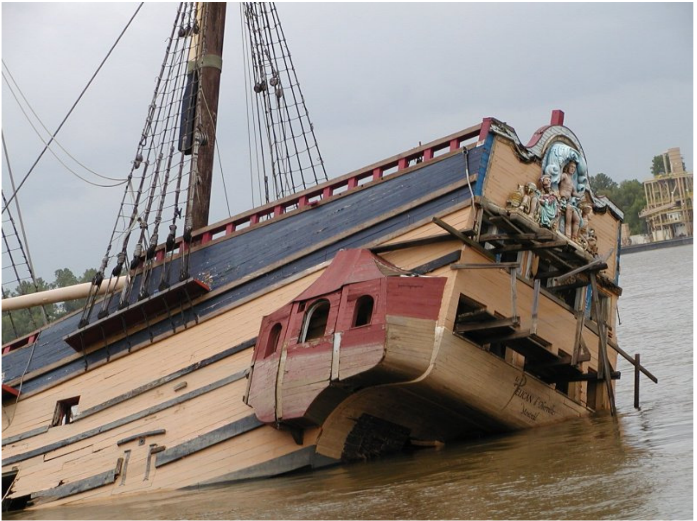
The replica Pelican sinks in the Mississippi